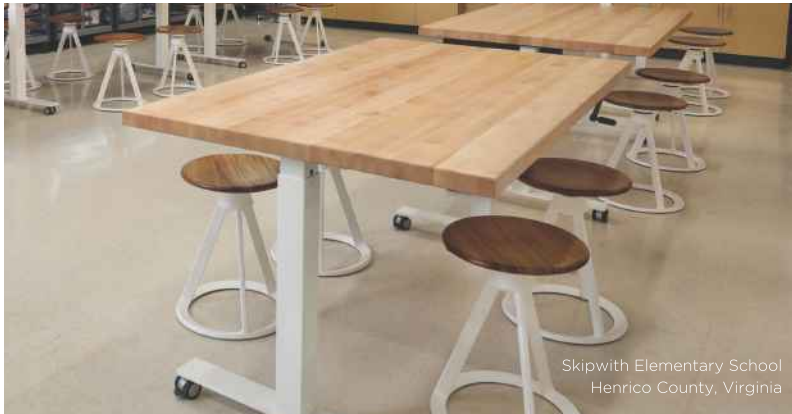
Skipwith Elementary School Henrico County, Virginia

solid maple butcher block or high performance laminate with pvc edge