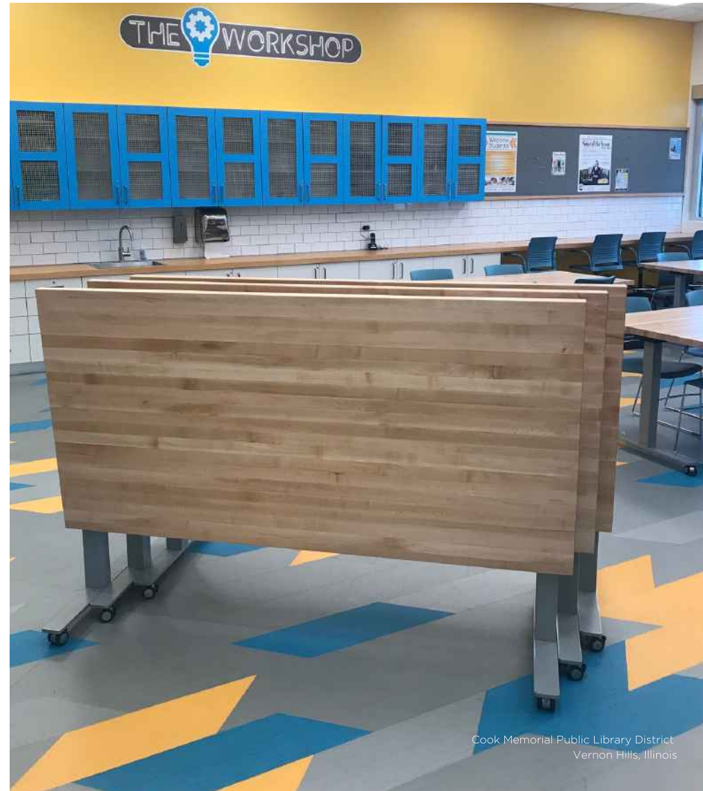
Cook Memorial Public Library District Vernon Hills, Illinois