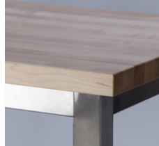
solid maple butcher block