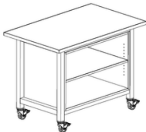
open storage modules

48"wide open storage and cabinet units include (1) module. 60" and 72" wide units include (2) modules.